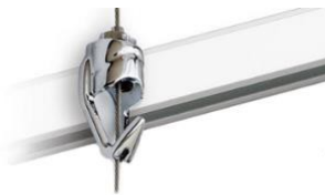
Installation system used by PVA