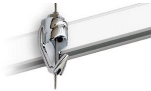
Installation system used by PVA